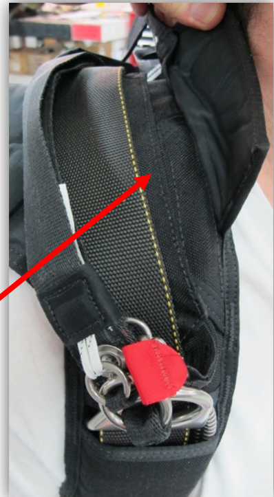
NEW Collins Lanyard Location

Collins Lanyard is now located in front of right side yoke under the RSL channel