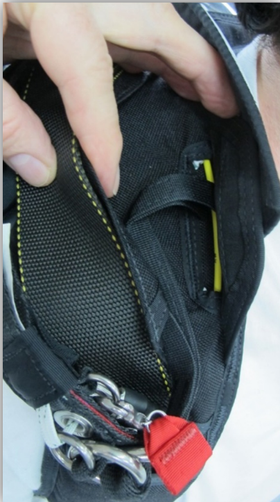
NEW Collins Lanyard Location

Collins Lanyard is now located in front of right side yoke under the RSL channel