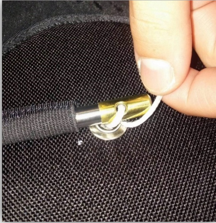
Improper Closing Loop Routing

Instructions: Place the reserve closing loop through AAD cutter according to diagram.